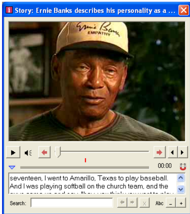
Figure 1. Story playback window: for "Video" treatment, story plays back as video; for "Still", the image stays fixed as shown (same audio for both).

representative qualities like the speaker's eyes being open. The representative image for the story "Ernie Banks describes his personality..." is shown in Figure 1.