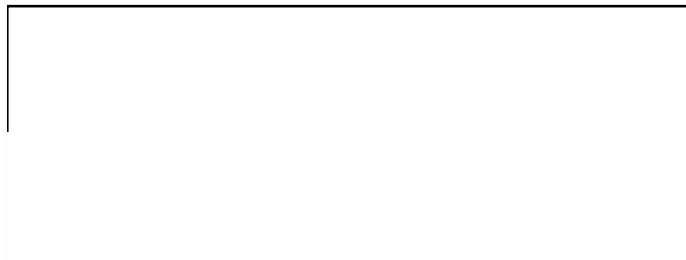
Figure 1: Typical AOIs

2D-FFT: The AOI is rescaled to a 64x64 pixel image so that the 2 dimensional FFT results also with 64x64 coefficients. We just consider the log magnitudes of the first 13x13 FFT coefficients and rescale them to [-1.0, 1.0]. (After multiplying the complex FFT space with a 13x13 window and applying the inverse FFT, we could still recognize in the resulting low passed original image the distinct lip shapes and movements.) The motivation for considering the FFT is, that this coding is spatial shift invariant. It makes the recognition more stable against inaccurate AOI positioning.