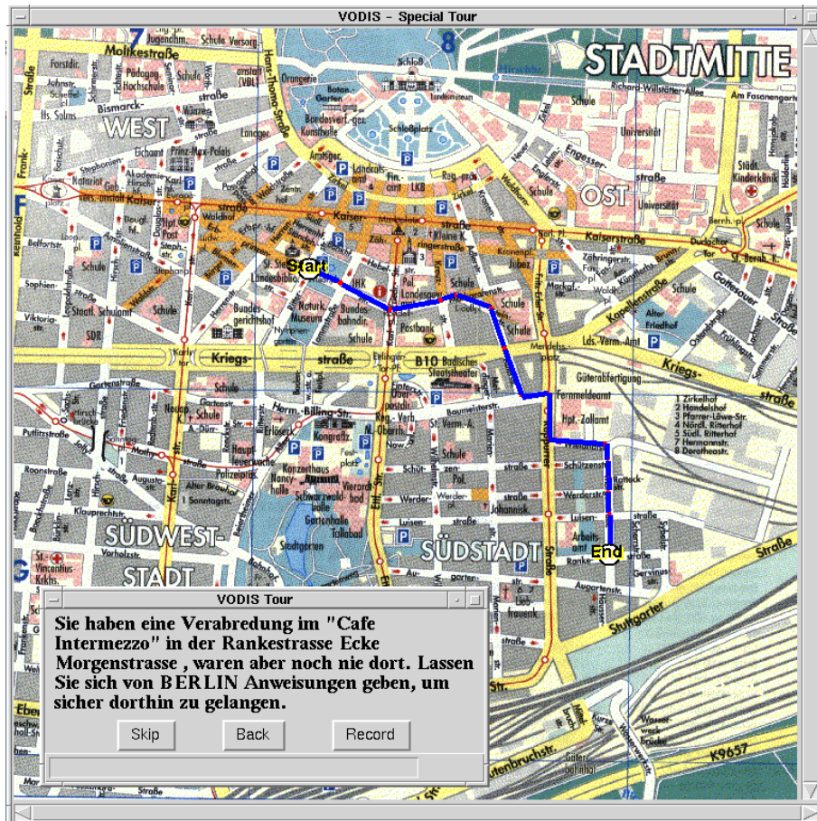
Figure 1: Example prompt of the Data Collection Tool used to simulate a navigation system

underlying semantic grammar is used. Both speech recognition system and parser were also trained to be able to handle spontaneous speech effects as coughing, laughter, lip smacks, breathing and so on.